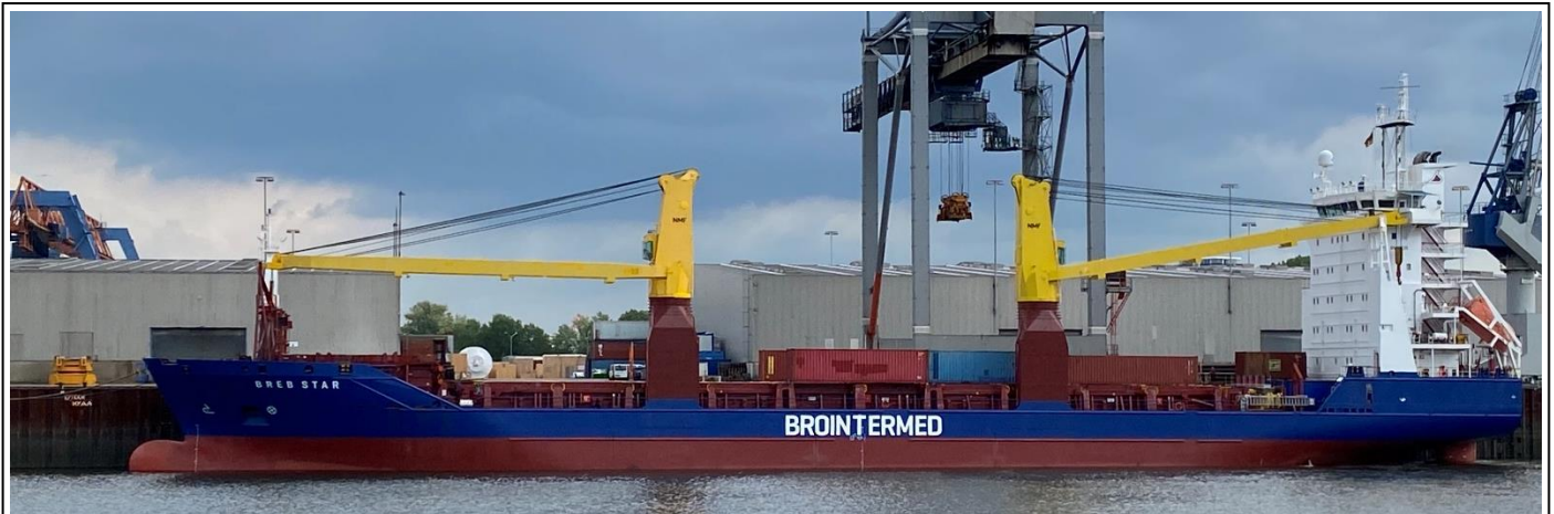
MV BREB STAR