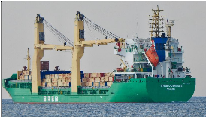
MV BREB COUNTESS